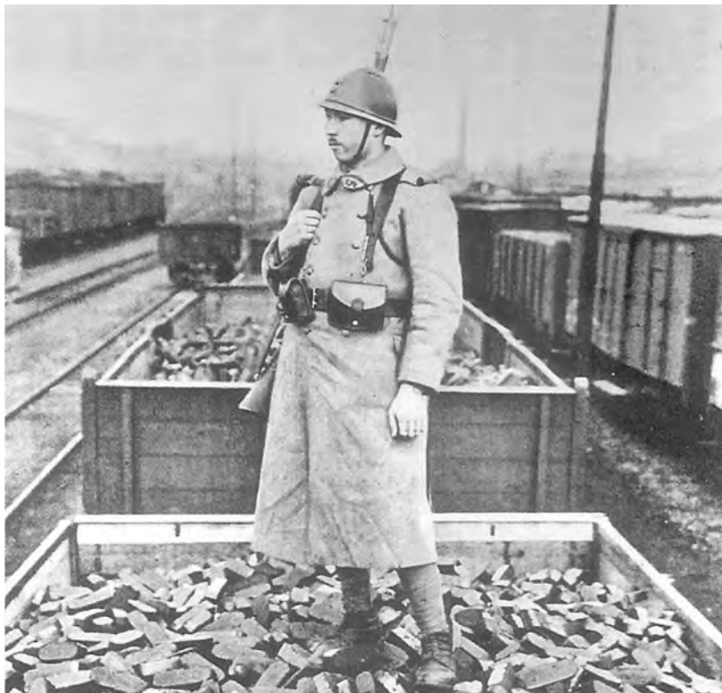
A photograph of a French soldier guarding a train in the Ruhr, 1923.