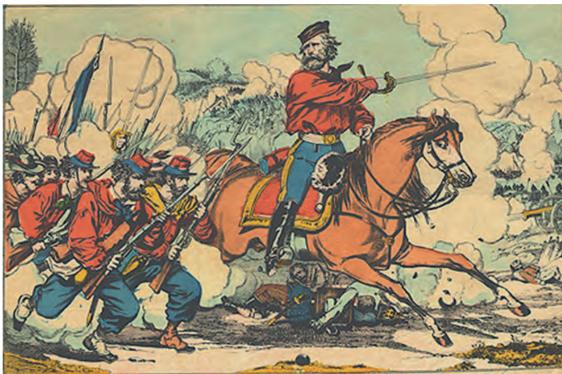
An illustration of Garibaldi and his army of Redshirts.