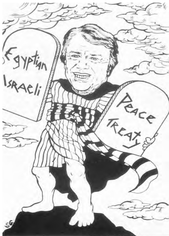
An American cartoon, showing President Carter, published in 1978.

20 Look at the cartoon, and then answer the questions which follow.